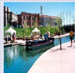
Channel at DeRose Sculpture Garden along Pueblo’s Historic Riverwalk Project.

Please note, however, the FPNM program is unaffiliated with, and does not financially support, proposals associated with limited stakes gambling within the community.