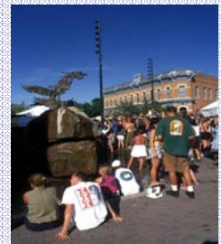
Concert Crowd in Old Town Fort Collins

The City will participate indirectly through the allowance of certain public finance tools that minimize exposure to project risks, while encouraging timely and equitable development review.