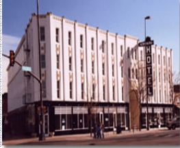
The Northern Hotel

A Fort Collins landmark preserved using federal tax credits